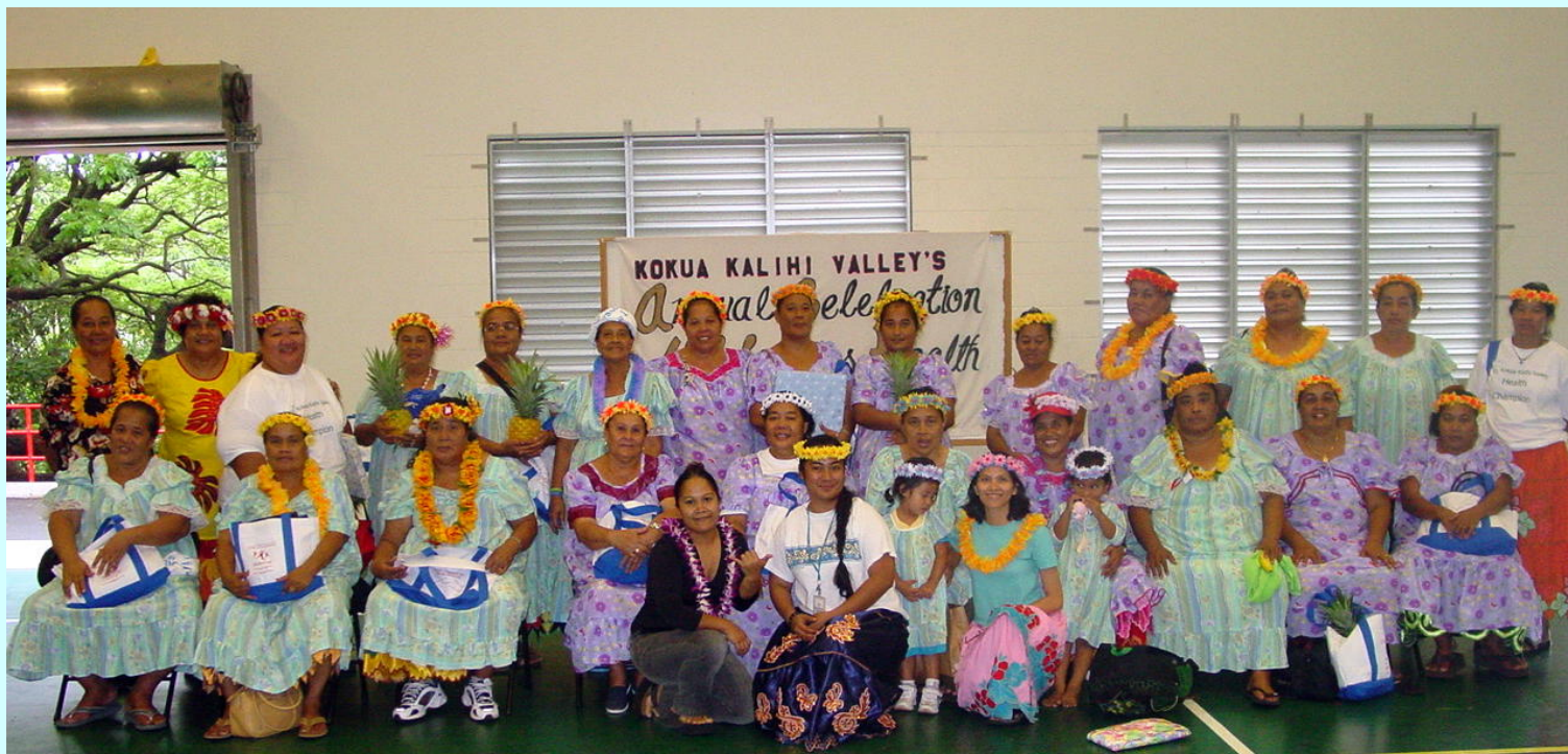
Chuukese Women's Health Group