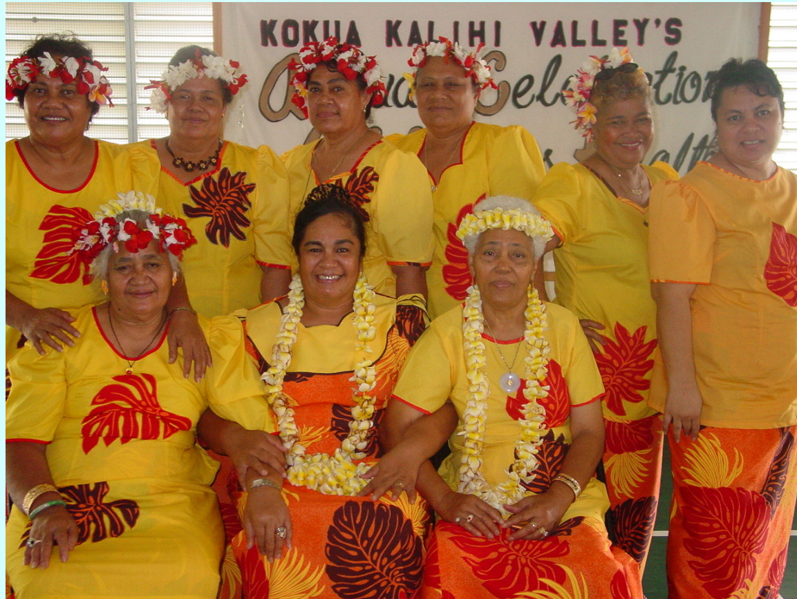
Samoan Women's Health Group